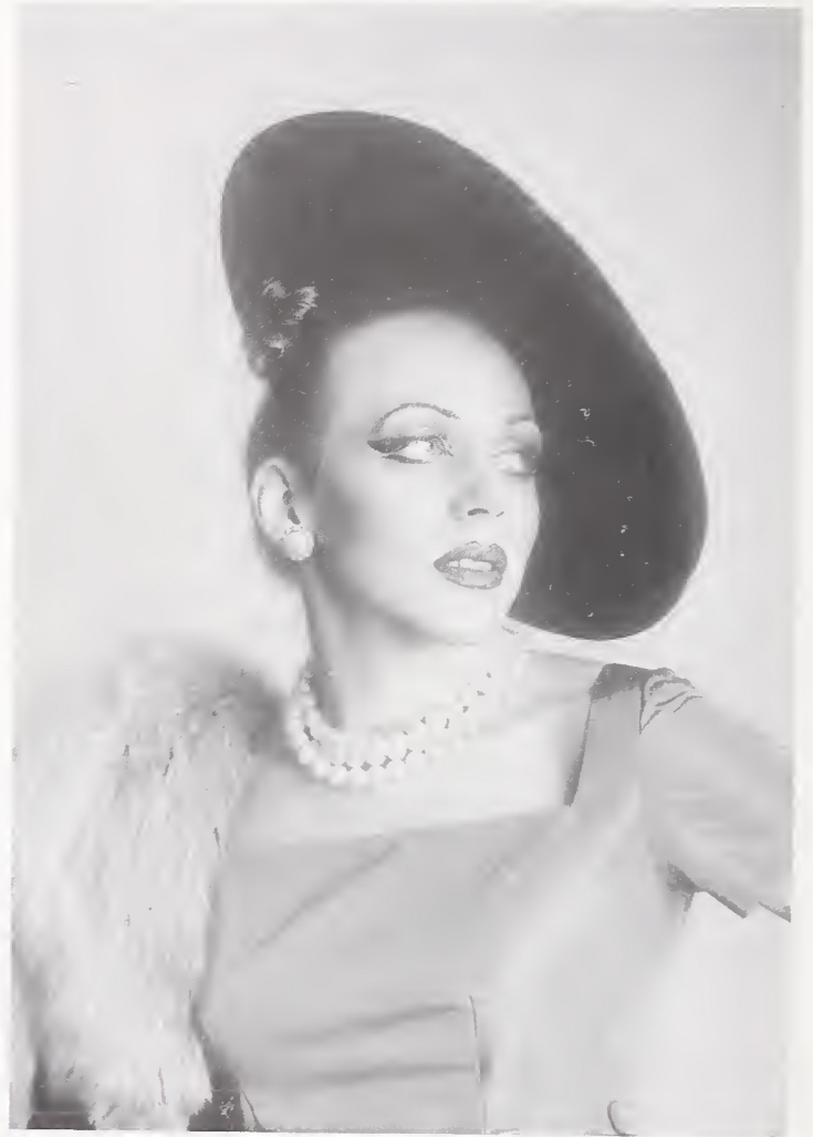
Above: One of "Tippi"'s Fave pix Below: That Beehive is her own hair.