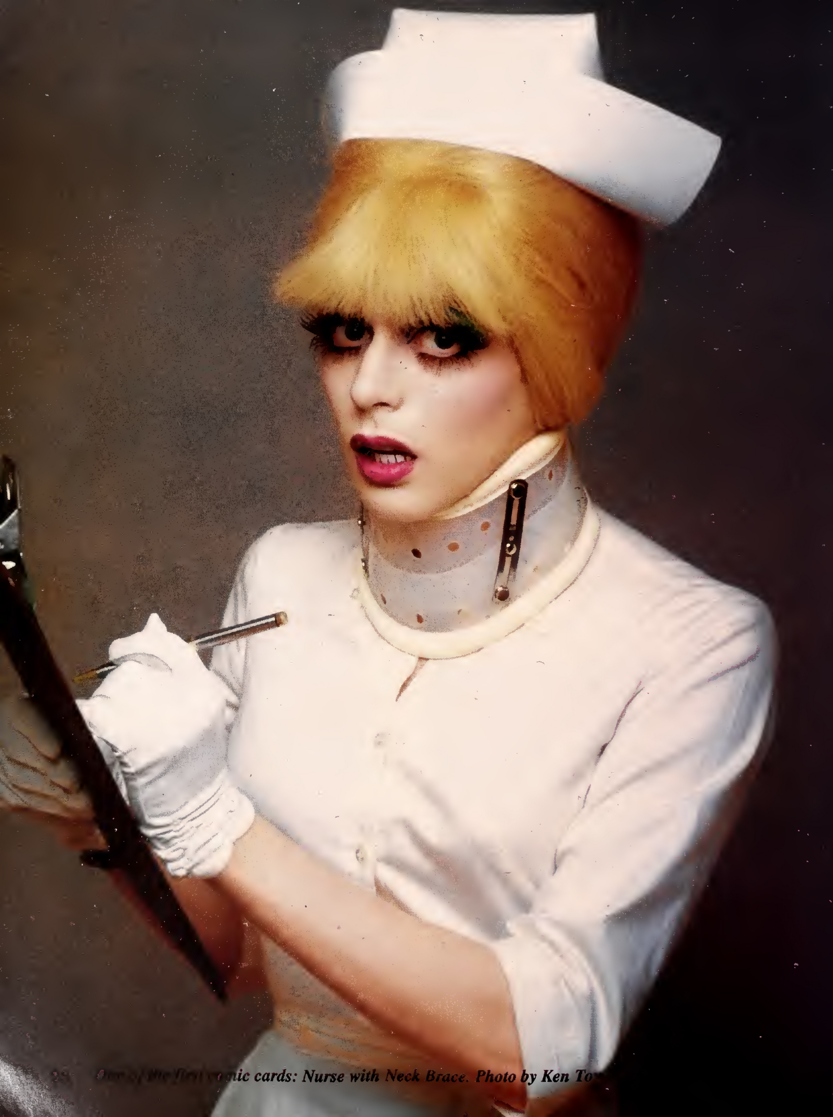
28 One of the first comic cards: Nurse with Neck Brace.