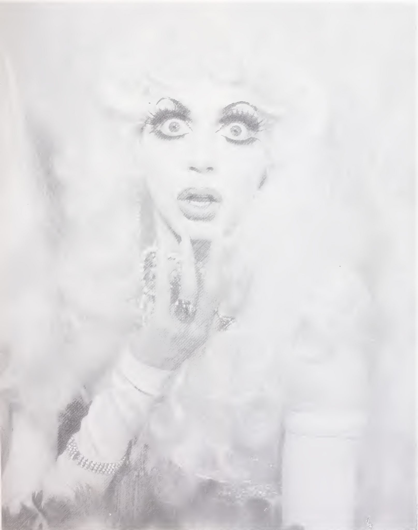
Big hair, big eyes & a handfull of pearls. Those hands & nails belong to Miss X.